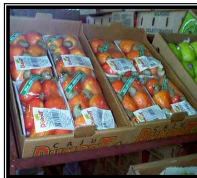
Cashew apples are displayed in open cardboard boxes of five of such trays (about 1.7kg)