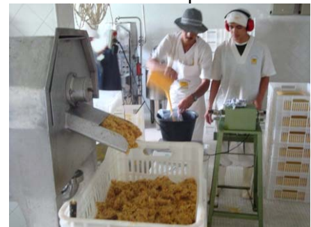
Cashew apple waste

The waste of the juice extraction, the dry cashew apple fibers can be used for the production of animal feed (see below).