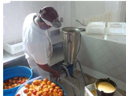
Cutting cashew apples