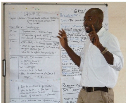
Presentation of outcomes from group discussions

So far, ACi has provided interactive training sessions for more than 20,000 cashew farmers in Ghana. As farmer income depends on the quality of the cashew kernels, ACi aims at increasing the outreach to farmers, encouraging them to adopt recommended practices and techniques to increase the quality of their produce. Training sessions make use of picture material accompanied by questions and answers and practical demonstrations in the field through extension agents, as well as ICT applications via text messages and a few radio programs.