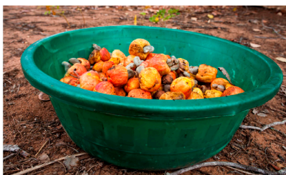
The harvest of cashew apples and nuts was delayed in West Africa this year

Almost all of Africa's cashew producing countries have seen lower than normal production volumes this year. Cote d'Ivoire, by far Africa's largest producer of RCN, is expected to record production up to 40% less than last year. This means Cote d'Ivoire could see a sharp dip in production figures from last year's 400,000MT to a figure more in the range of 250,000MT. The situation is similar but not quite as severe in Ghana, where some farmers have reported collecting only half the volume as last year, although others report more normal levels. A third flowering did not materialize there as usual. In Nigeria, only 70,000MT have arrived in Lagos, in contrast to early projections of 100,000MT. Senegal and The Gambia also experienced a short crop. Cold weather never before experienced in early April and unusual rains severely limited the size of the crop, which has pushed prices high in these two countries. In the region, only Burkina Faso has seen a normal crop.