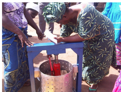
A tour participant tests juice processing equipment in Benin

The participants had the opportunity to ask questions about cashew apple juice processing and packaging and discuss best practices from experienced processors. In particular, participants learned of the importance of advanced food safety and hygiene systems as well as potential strategies for sourcing packaging materials and the cashew fruits themselves. Several pieces of equipment were purchased and brought back to the participants' home countries. This was a valuable opportunity for knowledge sharing across West Africa in a field with significant potential for income generation.