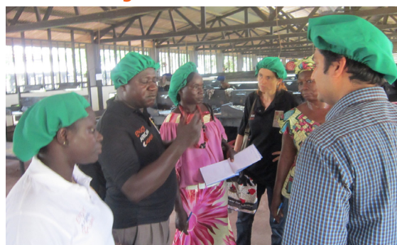
Tour Participants speak with a representative of Mim Cashew

In late March, ACA experts partnered with International Relief and Development (IRD) to facilitate a trip to Ghana and Benin focused on cashew apple processing. The goal of the trip was to develop understanding of technology options available and food safety management systems in larger-scale processing operations as well as to exchange experiences with cashew apple processors in Benin and Ghana. Seven participants from Senegal, The Gambia, and Guinea-Bissau (six of them women) visited juice co-operatives in Benin, the Mim Cashew Brandy plant in Ghana, the Blue Skies juice factory, and an Italian juice processing equipment manufacturer based in Ghana.