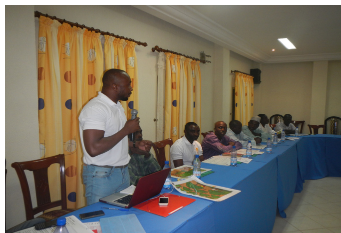
ACA delivers workshops on good agricultural practices in Benin