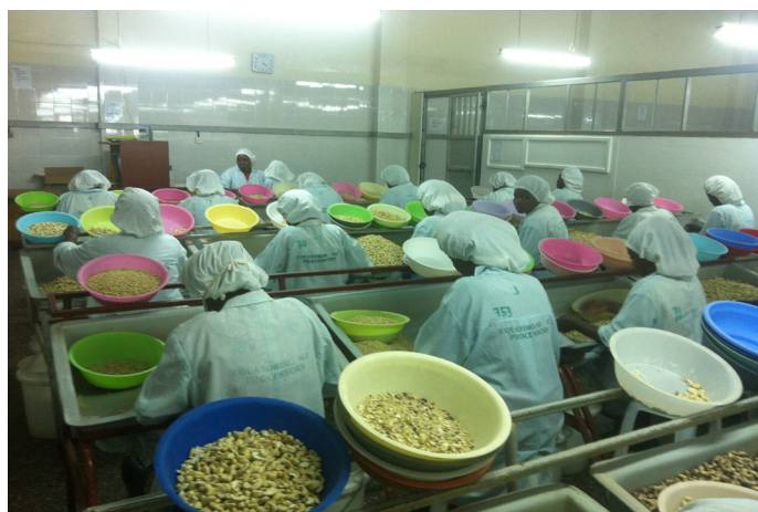
Employees of Equatorial Nut Processors (ENP)

May: Two of Kenya's foremost cashew processors, ENP and Jungle Nuts, were re-certified by the ACA Quality Seal program.