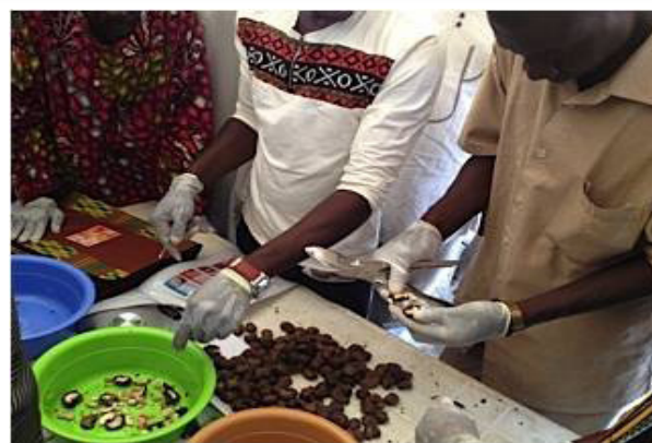
Harvest and Post-Harvest Best Practices Training

December: Throughout the month of December, 2,000 Nigerian farmers were trained on the principles of harvest and post-harvest techniques by the trainers who attended the ToT workshop the previous month. This knowledge- and skill-sharing supports the USAID TIME mission to empower rural cashew farmers to improve their livelihoods.